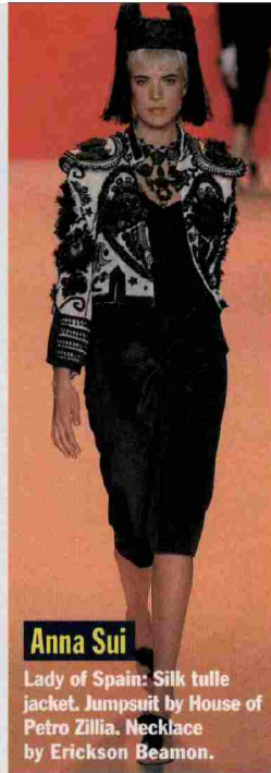
Anna Sui Lady of Spain: Silk tulle jacket. Jumpsuit by House of Petro Zillia. Necklace by Erickson Beamon.