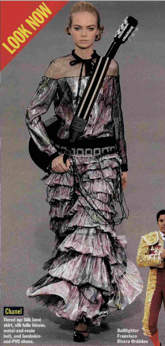
Chanel Tiered up: Silk lamé skirt, silk tulle blouse, metal-and-resin belt, and lambskin-and-PVC shoes.